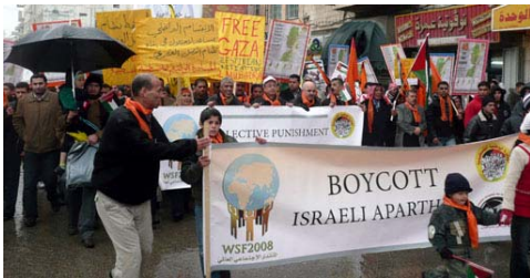
More than one hundred people marched in central Ramallah

the Wall Campaign on January 26. Protesters marched through Ramallah's central square carrying banners reading "Stop Israeli War Crimes in Gaza" and "Boycott Israeli Apartheid"