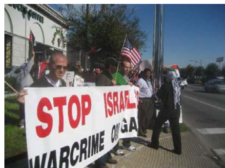
Stop war crime banner - Houston

Among the groups represented at the rallies were Americans United for Palestinian Human Rights, Jews for Justice, Jews for Peace, Women in Black, US Campaign to End the Israeli Occupation, ANSWER Coalition, United for Peace and Justice and others.