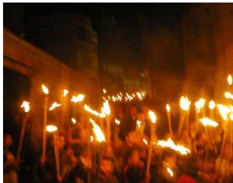
Kafer Kanna Arab town in solidarity

Protest in Jerusalem organized by the Al Aqsa Foundation for Rebuilding Muslim Holy Sites. Dozens of Palestinian residents, and peace activists, participated on the protest held on Thursday.